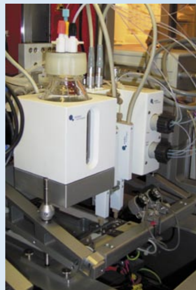
SCARINA Bulk Pen